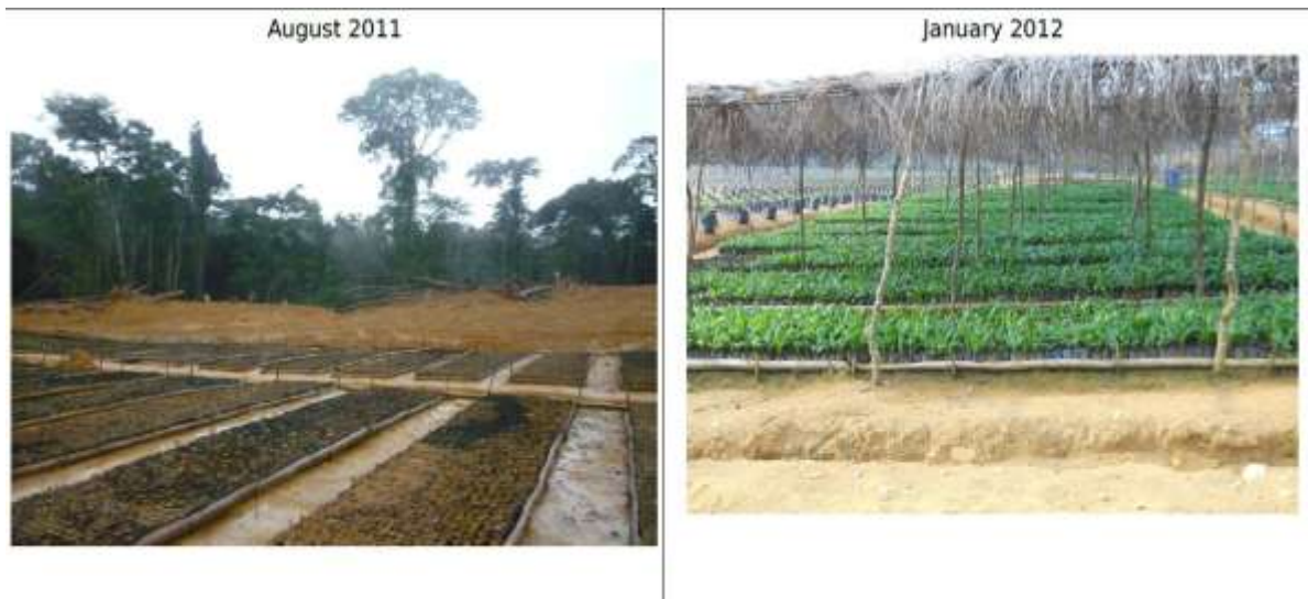
Photos of SGSOC's Palm Nurseries.

The extremely favorable terms of SGSOC's contract will permit the company to pay little or no taxes on a very profitable project.